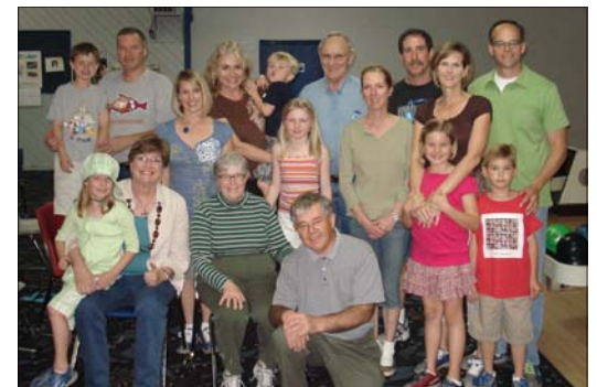
We also have some fun and fellowship. This is a class bowling outing.

In 2009 we are reading The Daily Walk Bible, New Living Translation, designed with 365 dated readings to encourage reading the bible in a year. At the end of 2009, the class will determine how to proceed with bible study for the following year.